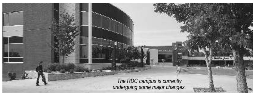
The RDC campus is currently undergoing some major changes.

HM: We look forward to seeing the changes on campus! •